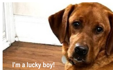
I'm a lucky boy!

Murphy's medical expenses totaled about $7,300 but it is foster dog Fernie who is setting the record for the year. So far, we've spent more than $25,000 for several abdominal surgeries, a special diet and training. Your donations make it possible for Brookline to help both of them plus many other Labs in 2025. The number of dogs coming to us needing medical interventions and extra training continues to rise. We are often their last hope and we don't want to turn any of them away. Thanks to the generosity of our donors, we haven't had to do that.